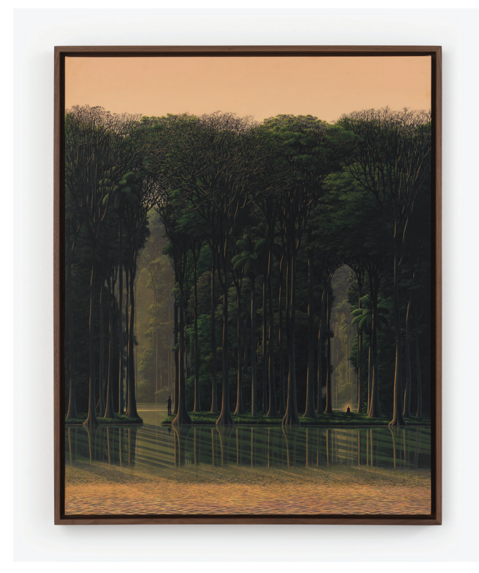
Light: Outside, Inside, 2021 acrylic on linen 39% × 31½ in. / 100 × 80 cm

Sánchez's recent compositions are notably anchored in the vocabulary of American abstraction and Minimalism. Within these paintings, there are inherent compositional tensions and harmonies, beyond the meticulous detail, that guide the viewer through space. Each painting on view is the result of months—often years—of the artist's dedicated attention.