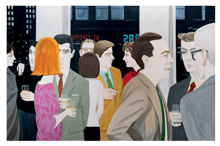
One of the artist's early group portraits, "The Cocktail Party" (1965).

Katz's own haute bohemian subject matter is one of the pleasures of looking at his work: A viewer will recognize various members of the artistic milieu in which he circulated. He was friends with a