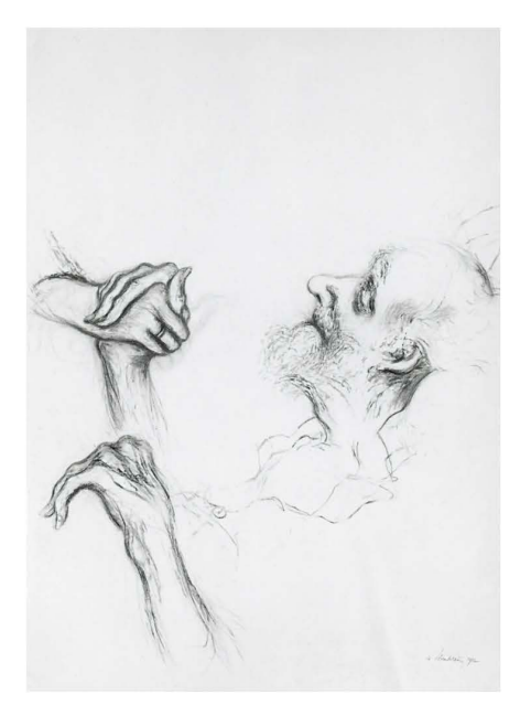
"Cedric Morris on his deathbed," 1982. Artwork courtesy the artist