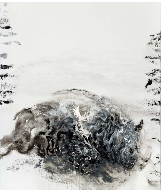
"Rhino without horn," 2019. Artwork courtesy the artist

an animal's pain. Some of them left me cold, but others, like "Rhino without horn," which shows a collapsed mass—all twisted muscle and bulk—beneath a heavy expanse of white, were almost unbearably sad.